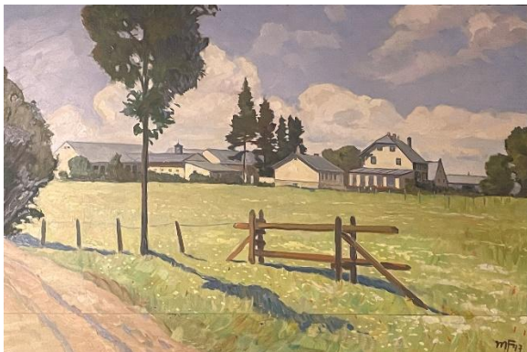
Photo: Herrendorf Estate, 1947 painting.